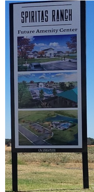
Future: Amenity Center, Lake Management